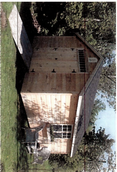
Classic Garden Shed